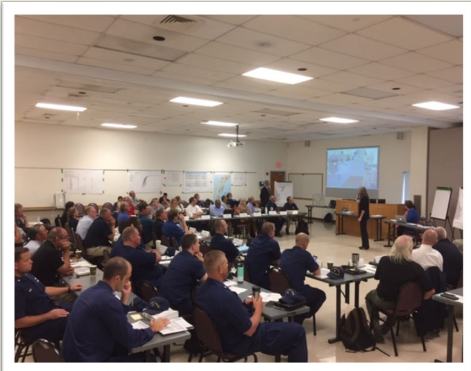
Offshore Spill PREP TTX 6 Sep 2018