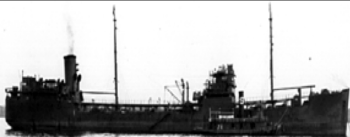
COLMBRIA - AG-36 11-8-41 - AG-36 (U.S. COAST GUARD)