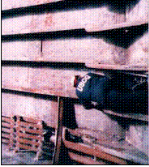
A Coast Guard Inspector checks inside a tank vessel

required existing tank vessels to be retrofitted or removed from this service in U.S. waters over a 25-year period, based on the age of the vessel.