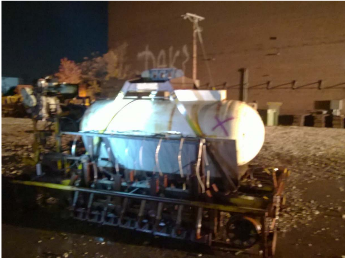
NJ Transit Leaking Propane Tank in Wood-Ridge Yard